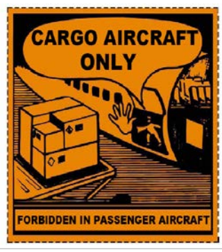
Cargo Aircraft Only Label

The following Class 9 Labels can also be used in lieu of the standard Class 9 Label above to designate the specific type of shipment.