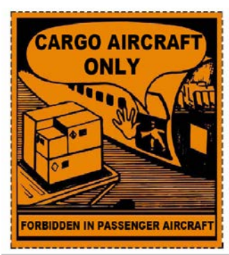
Cargo Aircraft Only Label

The following Class 9 Labels can also be used in lieu of the standard Class 9 Label above to designate the specific type of shipment.